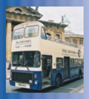
Touring the city