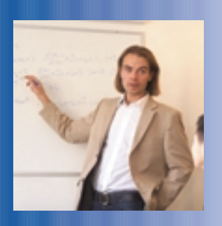
Experienced IB teachers