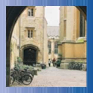
The historic university