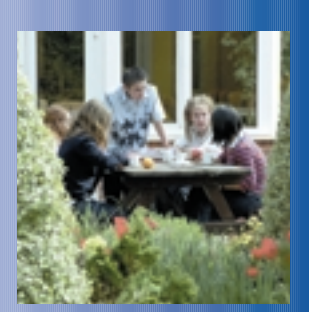
Outside the dining room