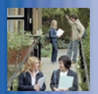
26 years providing the IB