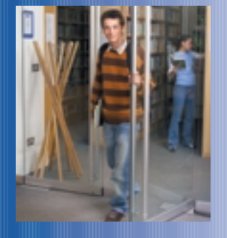
Inside the ARC

St. Clare's extensive collection of IB past papers and examiners' reports is an invaluable resource for Diploma teachers and students. ICT facilities including high speed Internet access are available to students within the ARC and in many other locations throughout the College.